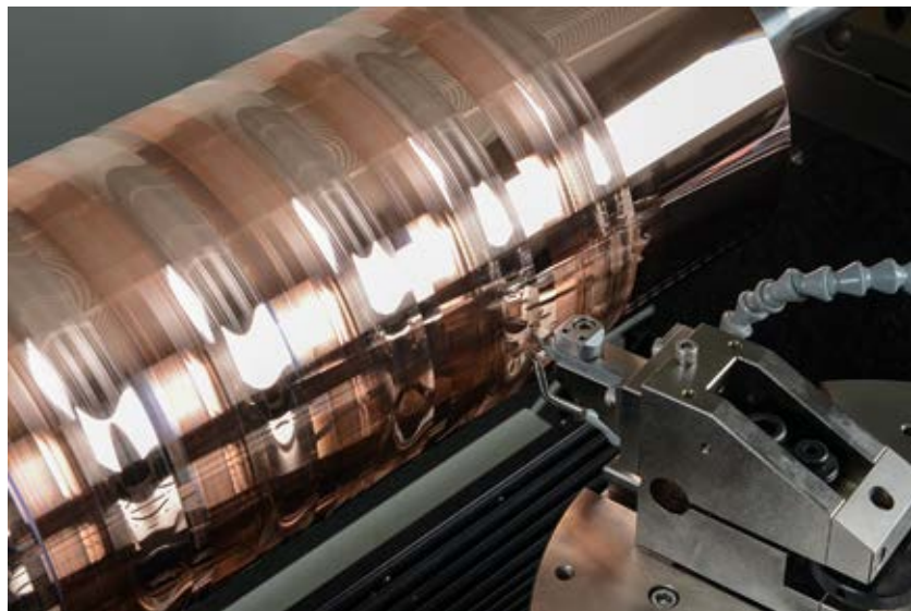
FIGURE 1: Setup for a diamond turning process on a copper drum.

For the realization of an ultra-precision turning process a special and highly precise machine is required. In (Fig.2) a Precitech DRL1270 lathe with granite