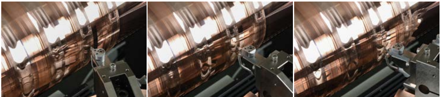
FIGURE 3: B-axis tool positioning in 315° orientation (left), 0° orientation (middle) and 45° (right).

Diamond tools offer a very high geometric definition along with outstanding sharpness. A diamond tool, which is declared as "sharp" offers a residual roundness between 10 nm and 20 nm, which is only visible under the scanning electron microscope. However, the potential of diamond tools cannot be fully explored yet, as the ultraprecision machining of large-area parts is still challenging and vulnerable to thermal and mechanical errors. At Fraunhofer IPT, a study has been conducted