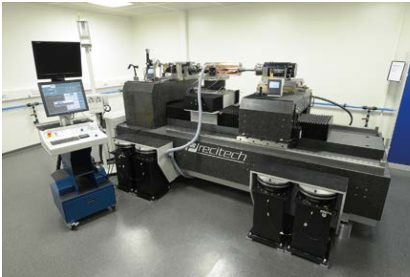
FIGURE 2: Machine setup for a diamond turning at Fraunhofer IPT.

high wear resistance due to their high hardness. A large variety of tip shapes is the basis for the manufacturing of complex geometries in the direct cutting process.